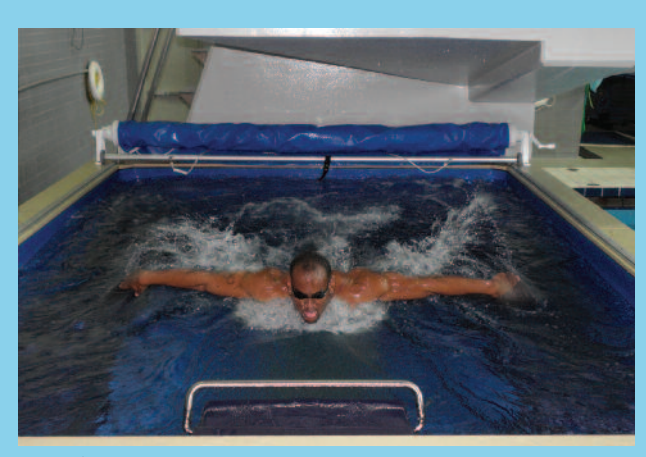
Eight-foot width to accommodate even the tallest swimmers.