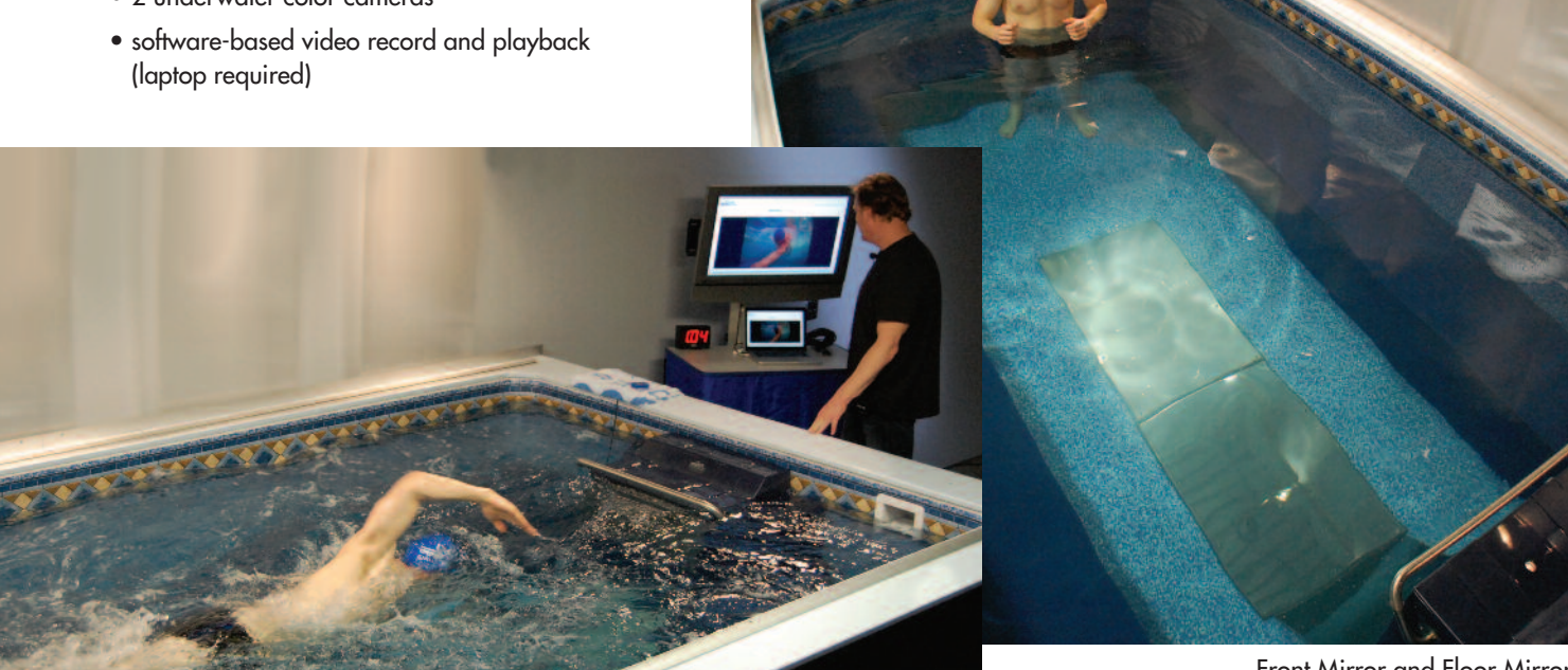
Front Mirror and Floor Mirror

For years at Auburn I trained my athletes in an Endless Pool — but the Elite we put in at SwimMAC takes it to another level. It expands my ability to provide the best technical advice possible ??