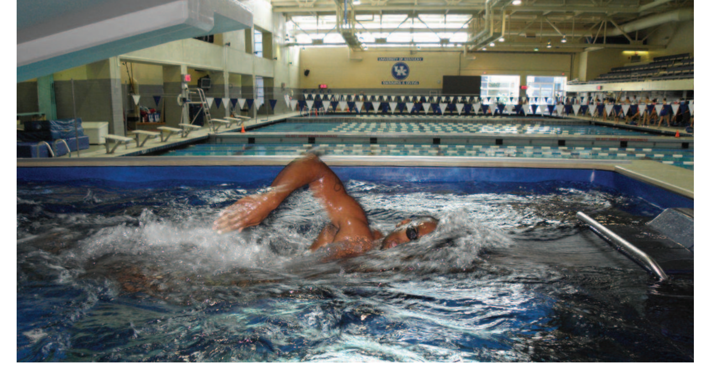
0:51 hundred-yard pace