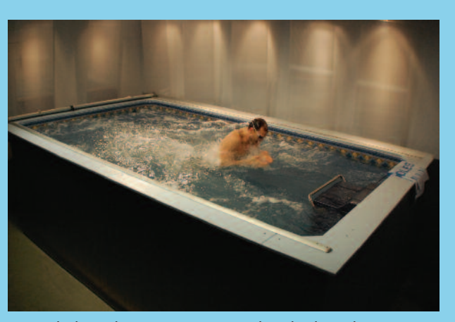
Smooth, broad swim current, 0:51 hundred-yard pace.